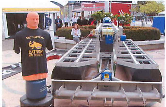
The catfish relaxing at AIMEX 2011.

"The bags can then either be harvested for their contents or converted into the landscape," Scheirs said. "Even the EPA is delighted with the way the bags can be stacked and then